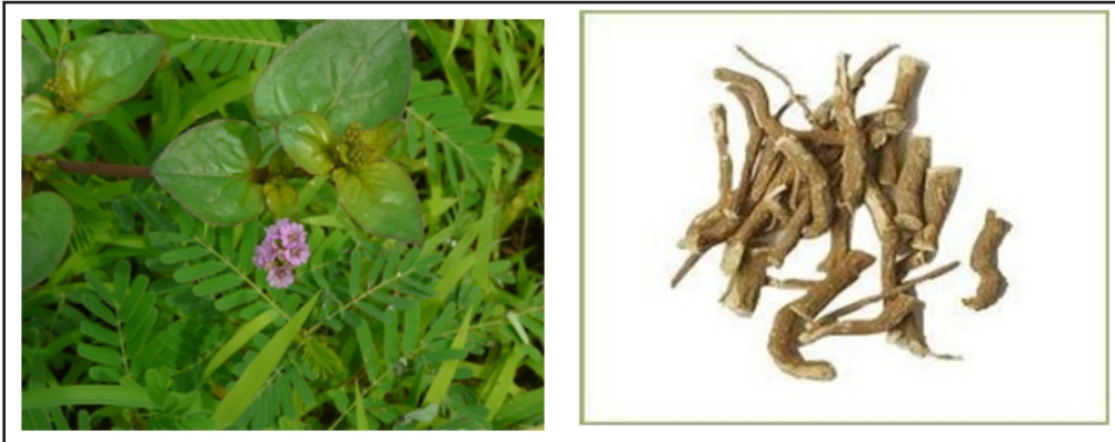
PLANT AND ROOTS OF BOERHAAVIA DIFFUSA